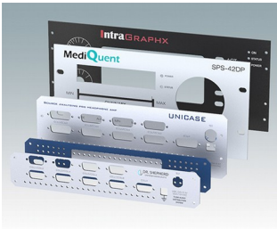
M0000410 Custom Front Panel Aluminium

Subject to technical modification without notice. © OKW Enclosures Ltd