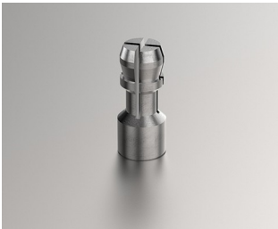
M0000704 PCB Standoffs Steel