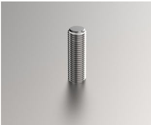
M0000700 Flush Head Fixing Studs Steel