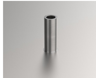
M0000702 Blind Standoffs Steel