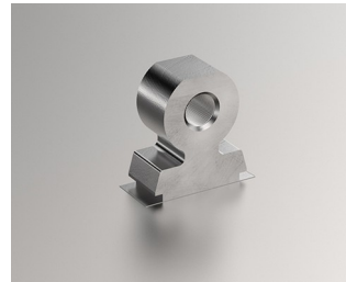
M0000721 Right Angle Panel Nuts Steel