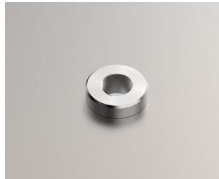
M0000720 Self-Clinch Nuts Steel